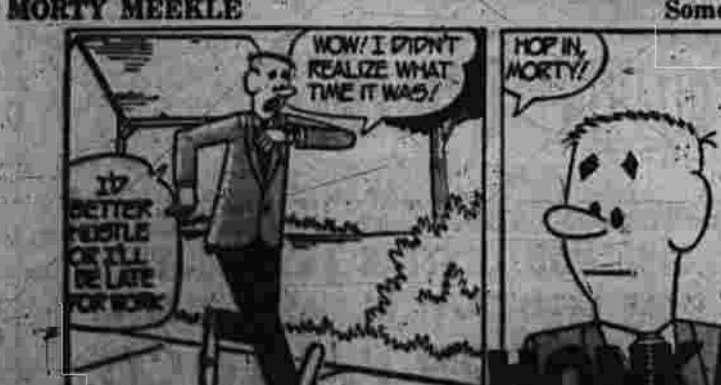
MORTY MEERLE BY DICK CAVALLI