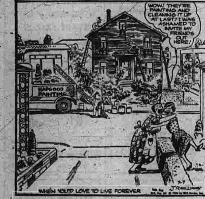
OUT OUR WAY BY J. R. WILLIAMS